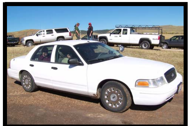
I was told that this State Police car drove the Gov.