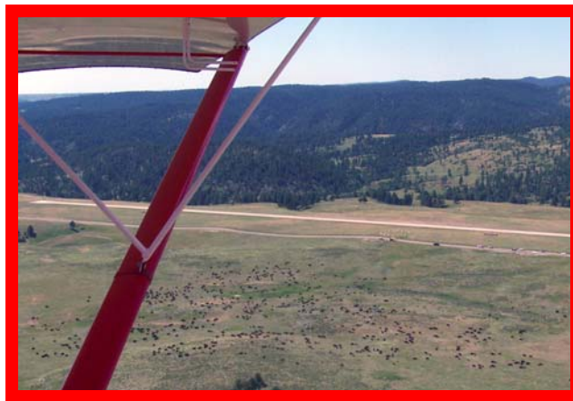
Those many "dots" in the field below are Buffalo

PS--Tonight I grilled myself a buffalo rib-eye steak with fries.