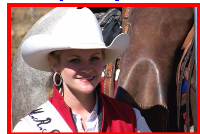
She certainly is a lot more enjoyable to look at