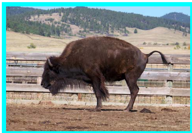
Nothing like a good poop after that work-out