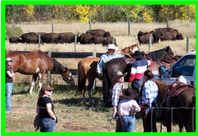
Cowboys, horses and buffalo, all at the corrals