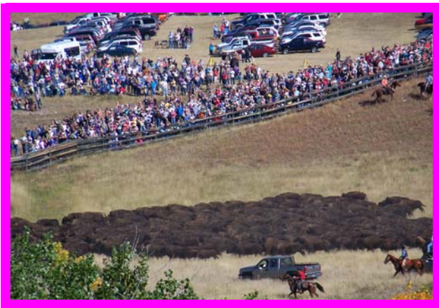
The herd enters the coral gates en-mass