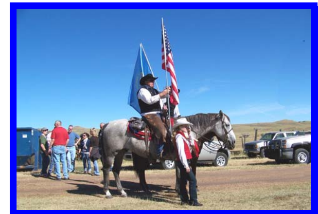
US & State Flag bearers along with Miss S.D. Rodeo