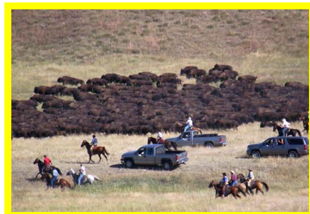
The herd size grows larger along the way