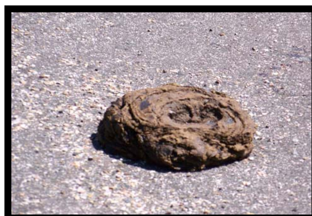
No explanation needed