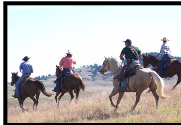
Cowboys hard at work moving the herd along