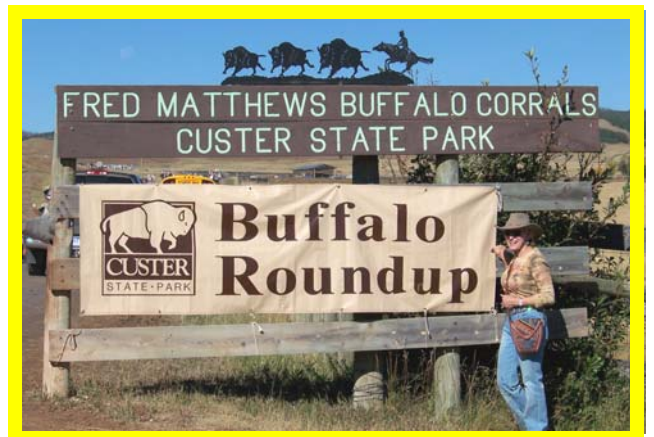
My boss made this sign when he worked at the Park