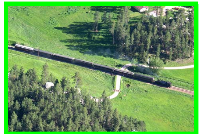
The 1880 train viewed from 600 feet above