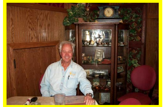
A Buffalo stew lunch at a Keystone eatery