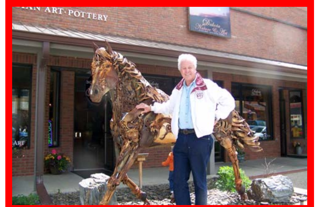
Me, in front of horse sculpture at Art Gallery