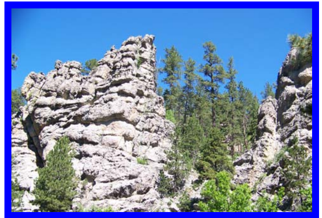
Some of the rocky scenery encountered

By now the afternoon temperatures had reached the mid 60's, so I opted for one of the open sided cars with a window seat, which allowed me to take some more photographs of the natural beauty of the Black Hills.