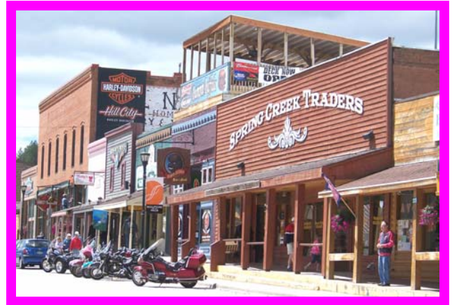
Downtown Hill City - motorcycles all over

We almost immediately began traveling uphill and soon the open valleys gave way to the rocky terrain leading into Keystone. Along the way we had several clear views of the Herney Peak, which is the highest point east of the Rockies, topping out at 7,242 feet. However, since my Custer County Airport elevation is 5,600, this means that this "mountain" is only 1,650 feet or so above the surrounding terrain. Later that day I took my plane up to retrace the track between Hill City and Keystone and had a chance to photograph the stone lookout tower atop that Herney Peak from 7,500 feet and about a mile away. I also had the good fortune to locate the 1880 train as it steamed its way back to its home depot and got a nice photo of it traversing through one of those open valley's.