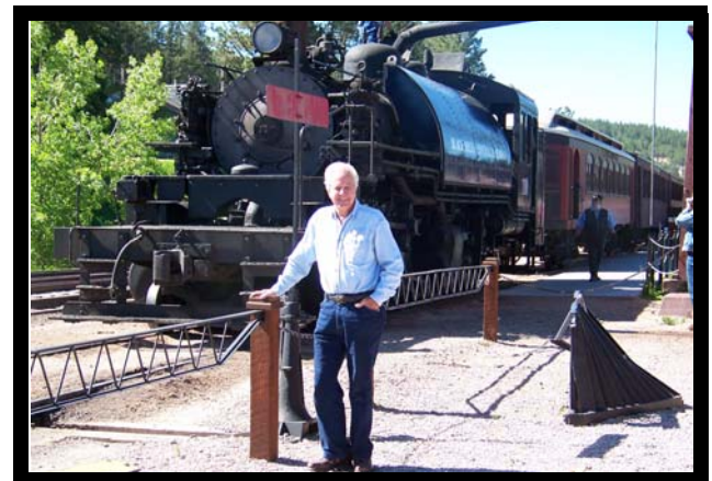
1880 Steam Train at the Hill City Depot