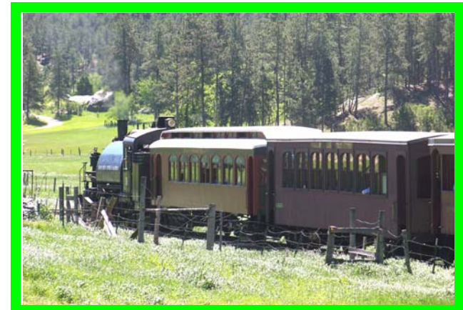
1880 Train rolling across "hill and dale"