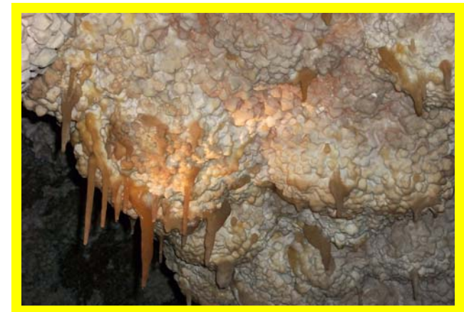
Some of the formations found on the cave walls