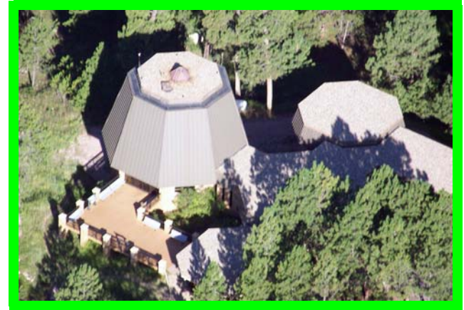
This is the cave's entrance, elevator and museum